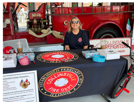
Collinsville Fire Department at Italian Fest and Maryville Fall Festival